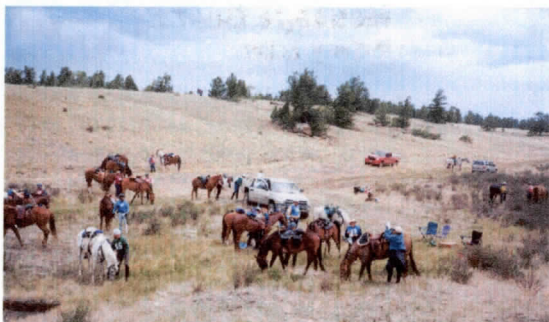
Saturday's Lunch break at Willow Springs CTR