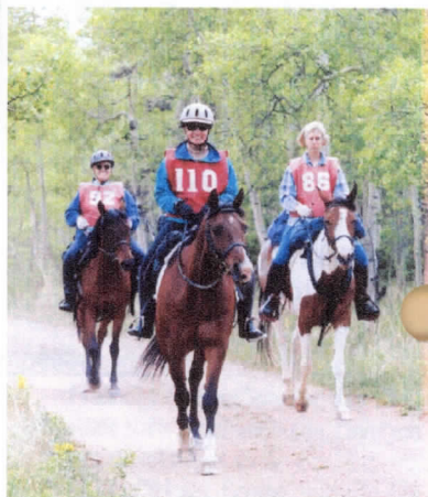
Willow Springs CTR Novice Riders coming on!