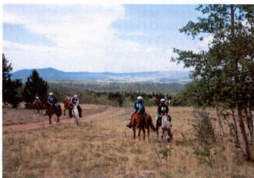
A relaxing portion of Willow Springs CTR trail with riders enjoying scenery and each other!

Editor's Plea - Many riders do carry small cameras on the trail...please consider sharing pix of your vision of a trail you have ridden with all of Region III! Send me photos and even stories of your experience for publication. We all enjoy reading about an adventure! Pictures are often a great substitute for 1000's of words!