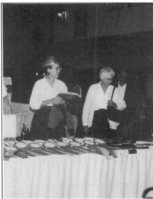
CHECKING OUT THE LOOT at the Region Three awards dinner.